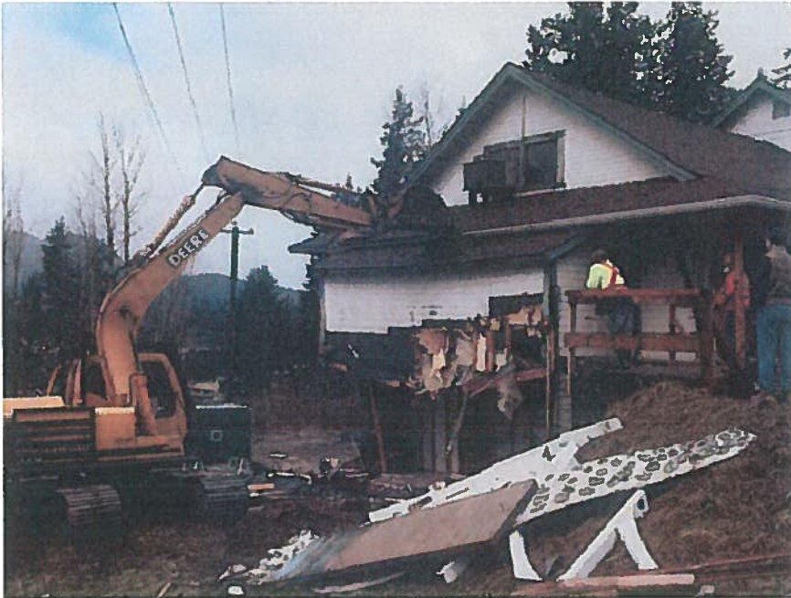
Removal of Add-on Storage Room