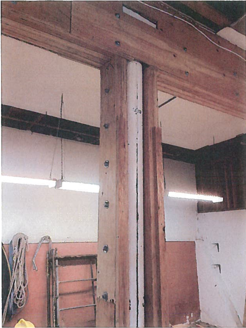
New Basement Beams and Pillars