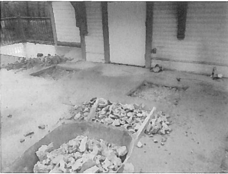
Front Pillar Footings Being Excavated