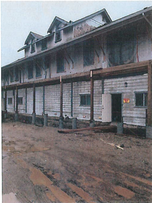
Construction of Veranda and Pillars